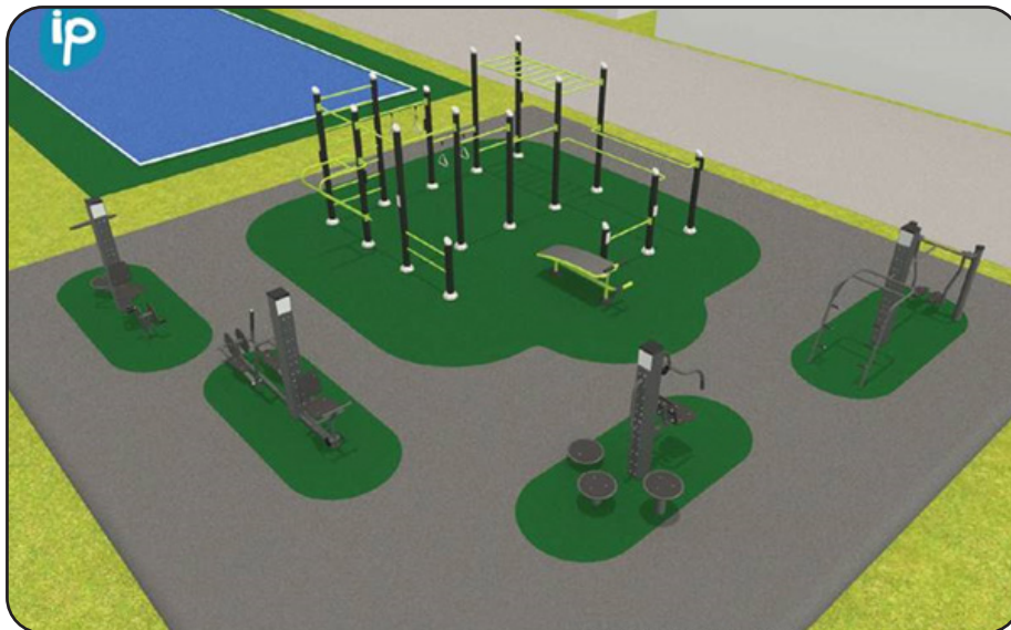
Image of the new outside gym we are getting build at the College.

Friday 10th November will be a student free day (except for students sitting Visual Communication & Design exam). This has been deemed a professional development/planning day for staff.